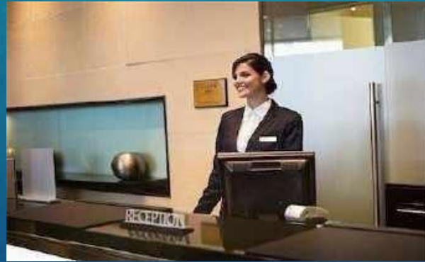
Bookings & Reservations