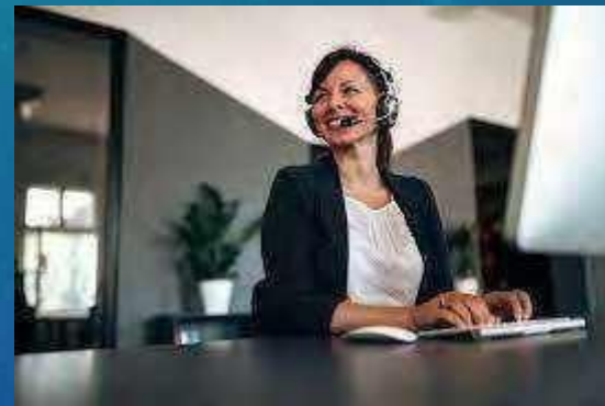
Dealing with difficult customers