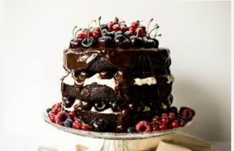
3 Master Cake Maker Course 5 Gateaux