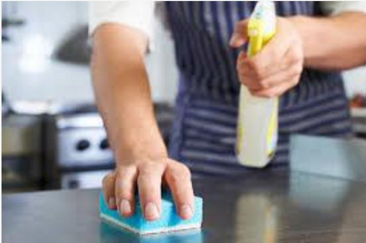
1 Kitchen Hygiene