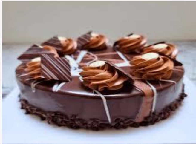
2 Professional Cake Maker Course 6 Cakes